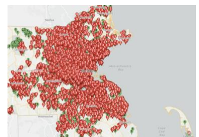
Current gas leaks Boston

There are plenty active (red) ones in your vicinity and some repaired (green) ones. There is also a “special” one labeled “SEI” - that is a leak of “Significant Environmental Impact” - what is colloquially called a “super-emitter.” The thing that makes this especially useful is that as good a job as HEET does of recording the utility data, the utility data is sometimes out of date and off the mark - like a repair may still be leaking, or a leak may be in a different location than the pinpoint.